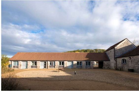
Studio Bedroom Exterior