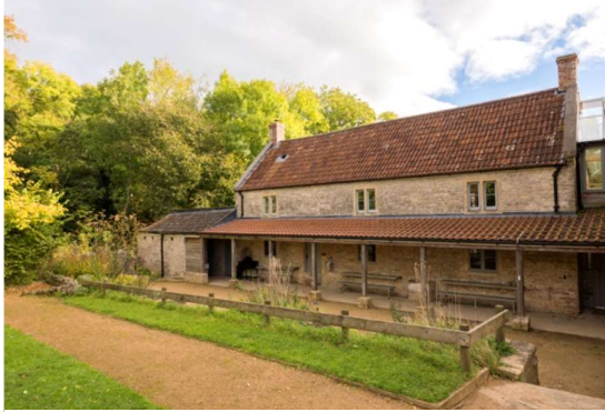
Farmhouse Bedroom Exterior